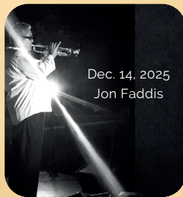
Guest Artist: $3,500