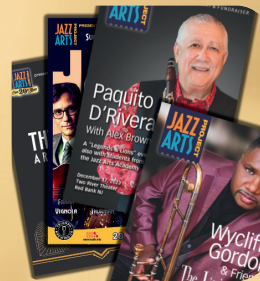
Program Ad Journal: $1500