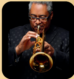
The Legends $2,500