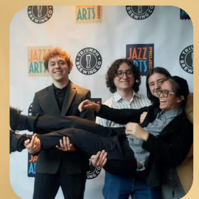
Sponsor a Jazz Arts Academy Student $550 (per semester)

Journal Ads offer an opportunity for your business name to be in the hands of all concert attendees while supporting our mission and enabling us to cover the costs of production. We produce an appealing printed booklet which includes concert information, community notices, photos, and ads. It is a powerful way to show your commitment to supporting the arts in our community.