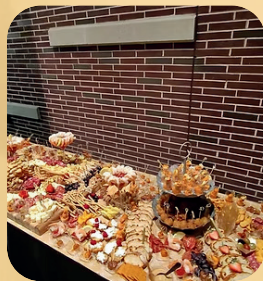
Post Concert Reception: $2500