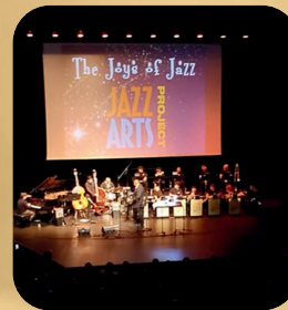
The Music $500