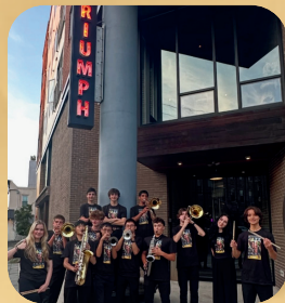
The Lions $1,000