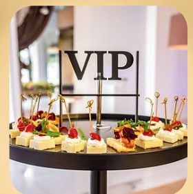
VIP Reception: $1000

Jazz Arts Project believes in the power of music to change lives. Across generations and through all kinds of cultural and socio-economic divides, Jazz is an art form that embodies the freedom of expression that our country was founded upon. Your support enables us to continue offering valuable programs that enrich the cultural landscape of our communities and transform the lives of countless area youth.